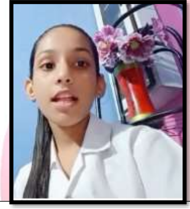
CLASS VIII: 'Concours de Talent' -Singing a French song