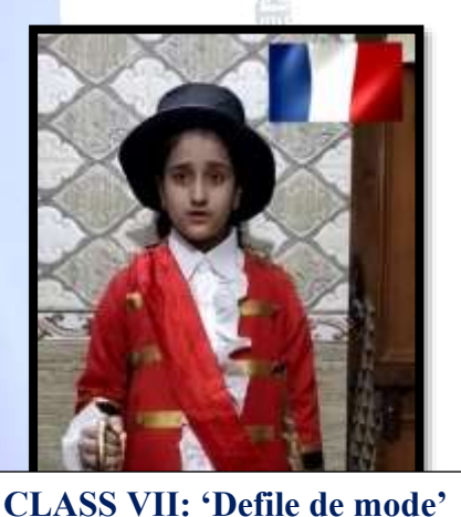
- Dressing up as a famous personality from the French literature.